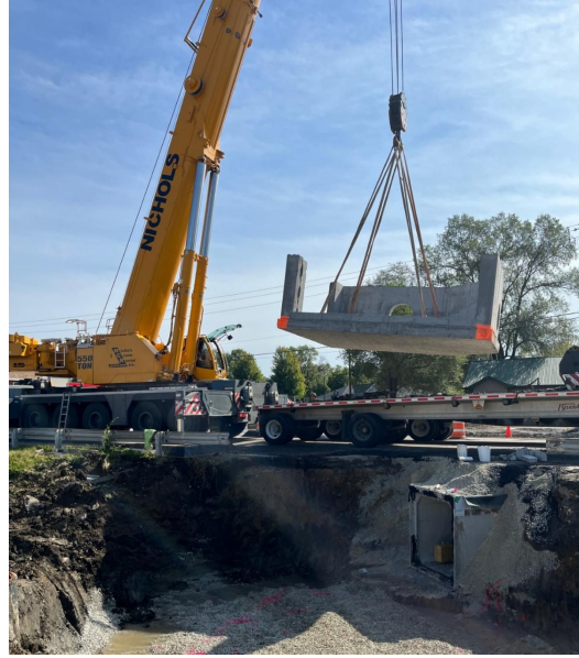
Box culvert installation