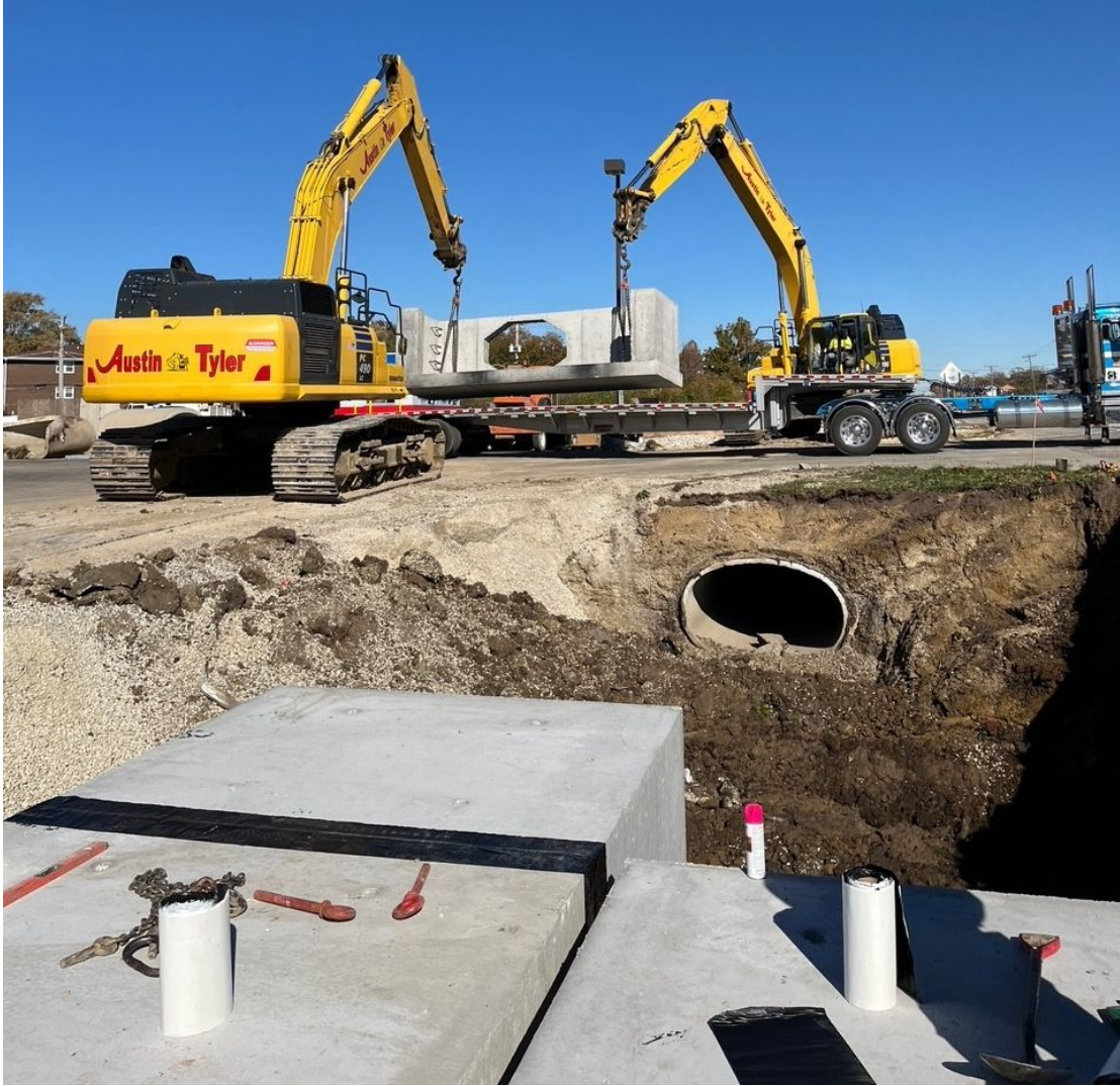
Concrete box culvert installation