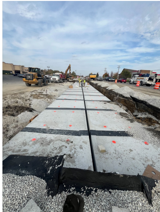
Box culvert installation

Any impacts to traffic or lane closures will be shared daily. Please use caution when traveling through the area.