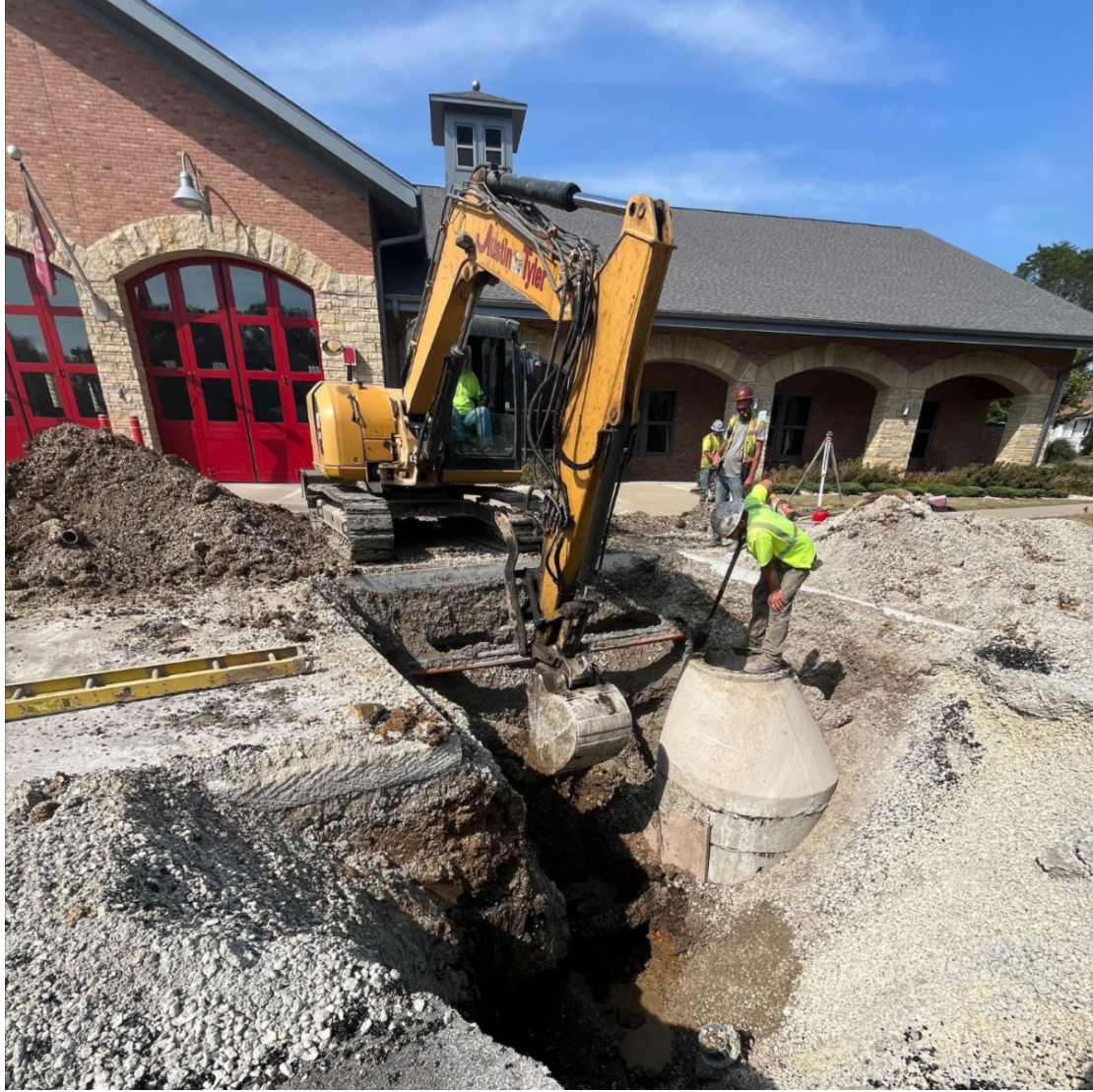
Storm sewer installation