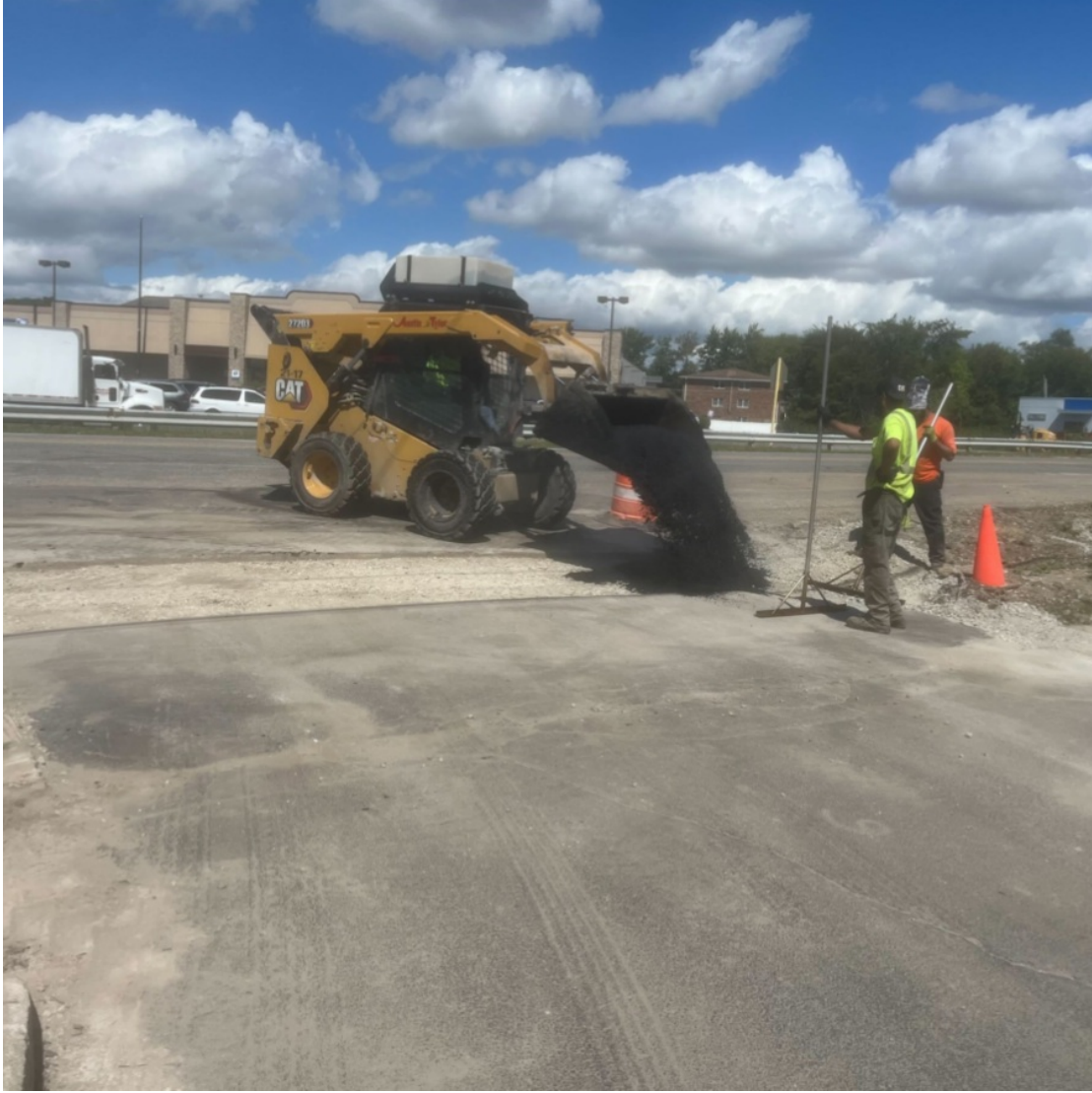
Paving driveways with HMA mix