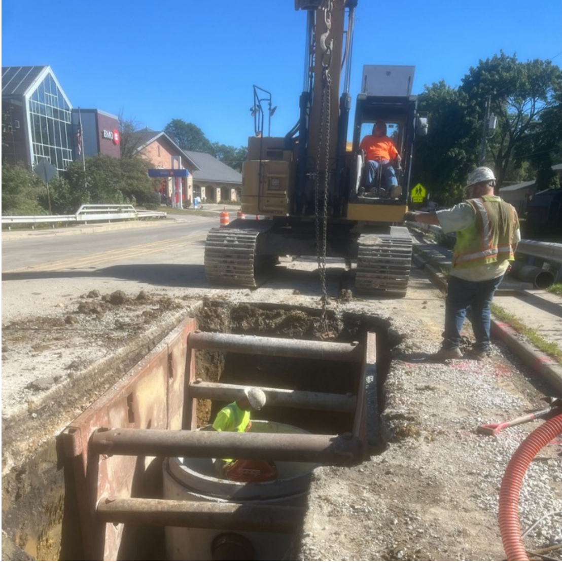
Storm sewer installation