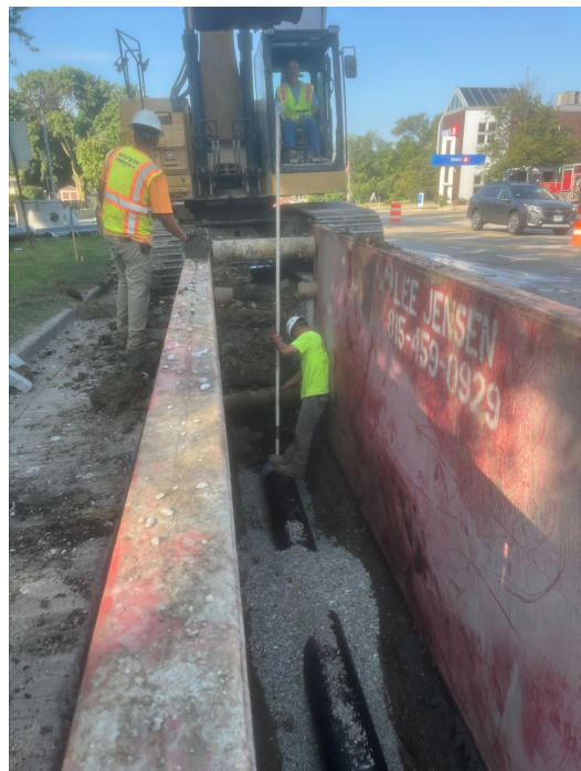
Watermain installation along Illinois Route 7