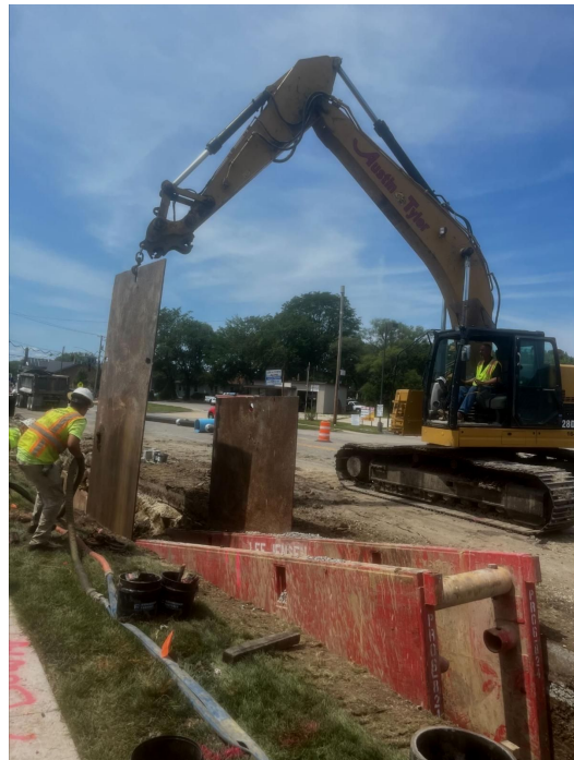
Watermain installation along Illinois Route 7