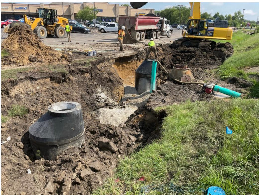
Sanitary sewer installation

Businesses are open during construction and access to driveways will be maintained throughout construction!