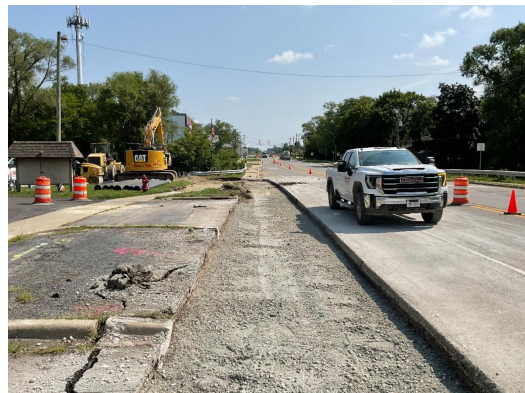
Excavation for temporary pavement